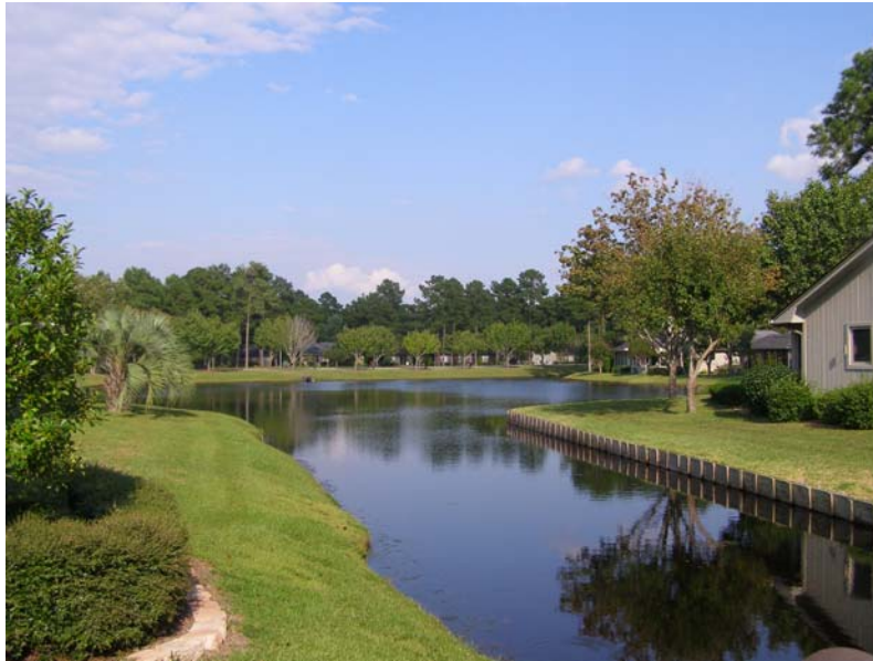
LAKE CORMORANT AS SEEN FROM JUNEBERRY LANE