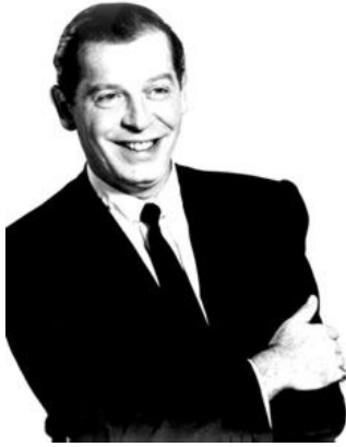
Milton Berle & Annie Oakley