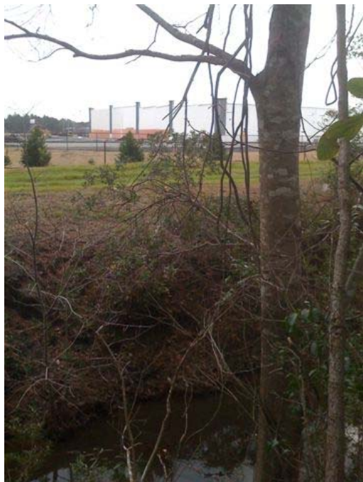
The Wal*Mart project as seen from the rear of the park between 154 and 156 Myrtle Trce Drive. The water in the foreground is the County Ditch.