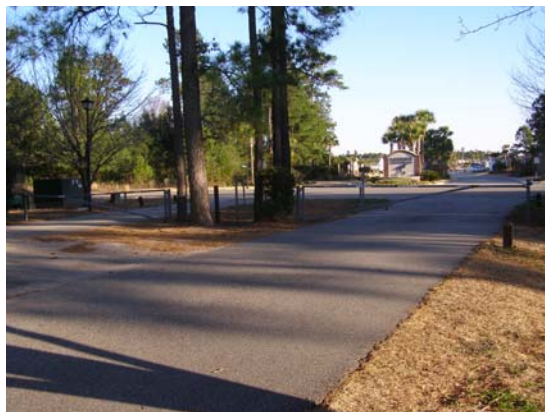
The Gates At Myrtle Trace THEY'VE SERVED US WELL !

Much more important - several dog walkers have been observed walking after dark without flashlights and wearing dark clothing. This makes them extremely difficult to see especially considering the advanced age of many of our drivers. Please, let's avoid having a tragic accident.