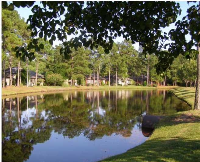
Lake Osprey as seen from Myrtle Trace Drive